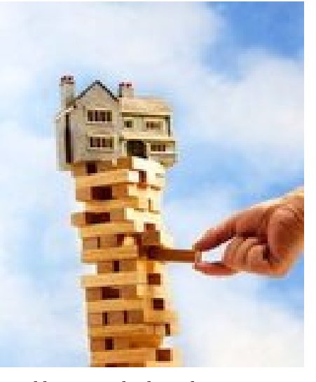
Building strong bridges of cooperation and commitment in short-cycle higher education across Europe and the United States

LEIDO Hans Daale, Chair Verversstraat 153 1011 HZ Amsterdam, the Netherlands 0031 20 6248675 info@leido.nl