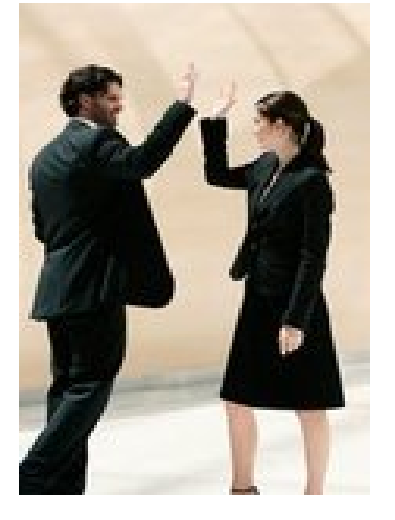
Competitive but together ...

The International University College (IUC) is a modern Business Higher School providing high quality of study programmes and professional trainings. The College is widely known for its rich experience of researches and developed modern educational systems in the field of tourism. economics and business.